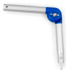
Cranked joint for telescopic pole