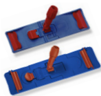
SPEEDY MOP HOLDER® - foldable plastic mop holder